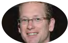
Dr. Nick Nurse: NBA Head Coach